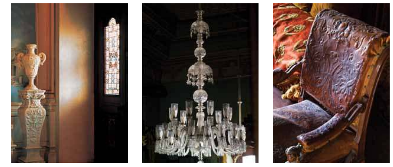
From replicating the chatoyant tapestries made of metallic copper yarn to refurbishing the Venetian chandeliers, each detail has been carefully restored under the personal supervision of Her Highness Princess Esra