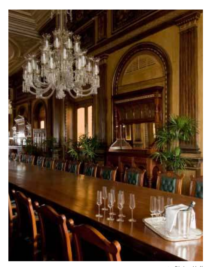
101 Dining Hall

The Dining Hall has the world's longest dining table, made in seven pieces which can seat 101 people at a time. Adding to its beauty are fve enchanting Belgian Chandeliers adorning the ceiling. The dining hall has a collection of art restored to its original glory. An ideal place for sit down lunches and dinners for a distinguished gathering.