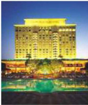
Number One, Mansingh Road New Delhi 110011, India Telephone: 91 11 23026162 Facsimile: 91 11 23026070 Email: mahal.delhi@tajhotels.com