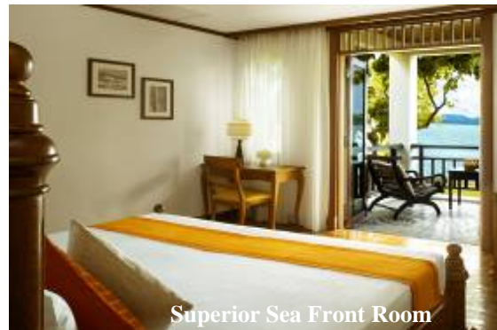
Superior Sea Front Room

Superior Sea View Rooms: 16 Superior Sea Front Rooms: 32 Deluxe Garden Rooms: 10