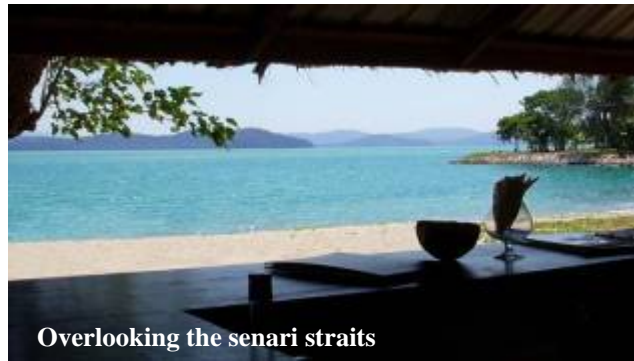
Overlooking the Senari Straits