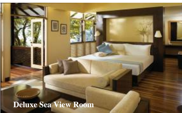
Deluxe Sea View Room