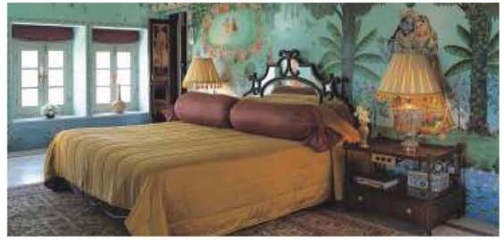
Sajjan Niwas Suite

• The Royal Butlers can create magical dining moments wherever you desire be it be within the luxury of your suite, a sit down dinner by the Lily Pond; a romantic dinner on the Mewar Terrace, dinner on the marigold decked royal barge or pontoon or a candle studded courtyard.