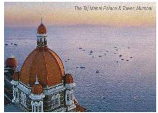
The Taj Mahal Palace & Tower, Mumbai

Established in 1903, Taj Hotels Resorts and Palaces is one of Asia's largest and finest group of hotels, comprising 59 hotels in 41 locations across India with an additional 18 international hotels in Australia, Maldives, Malaysia, UK, USA, Bhutan, Sri Lanka, Africa and the Middle East. From world-renowned landmarks to modern business hotels, idyllic beach resorts to authentic Rajput palaces, each Taj hotel offers an unrivalled fusion of warm Indian hospitality, world-class service and modern luxury. The Taj, a symbol of Indian hospitality, has recently completed the centenary of its landmark hotel, The Taj Mahal Palace & Tower, Mumbai. Taj Hotels Resorts and Palaces is part of the Tata Group, India's premier business house.